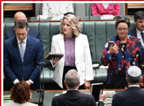
It was a proud moment to take the oath at the opening of the 47th Parliament.