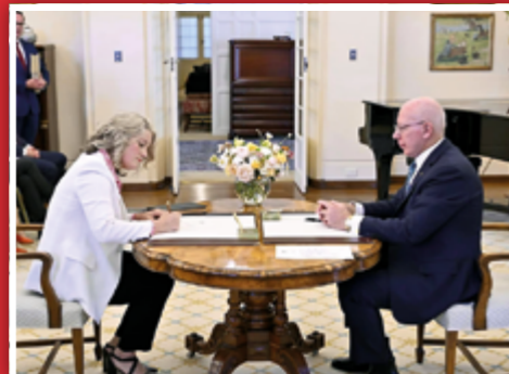
I was so honoured to be sworn in as the Minister for Home Affairs and Minister for Cyber Security in the 47th Parliament.