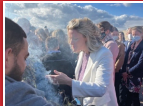
In recognition of First Nations People, the smoking ceremony is a tradition at the opening of Parliament. It's a moving ceremony.