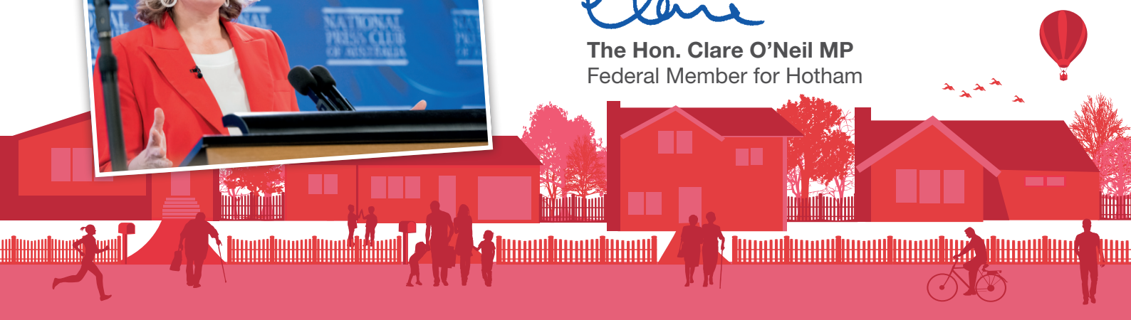
The Hon. Clare O'Neil MP Federal Member for Hotham

A handwritten signature in blue ink that reads 'Clare'.